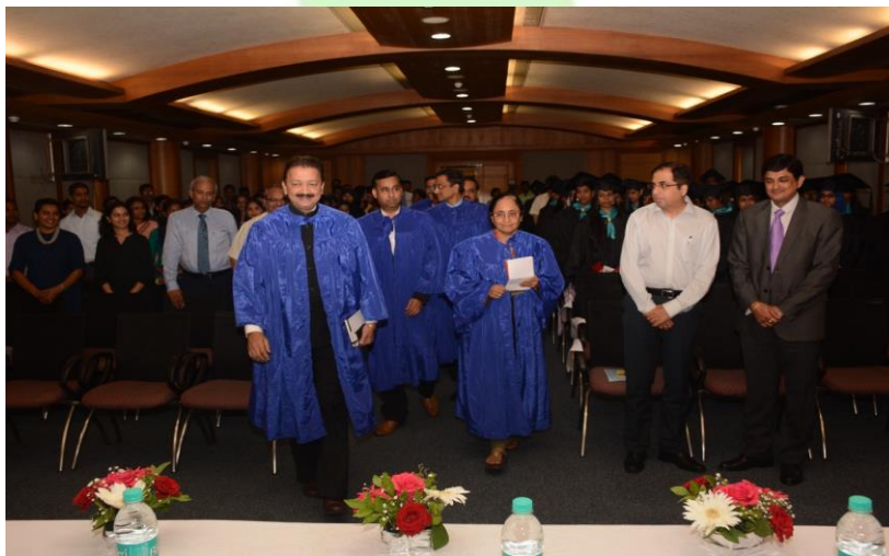
Convocation ceremony at P.D. Hinduja Hospital.