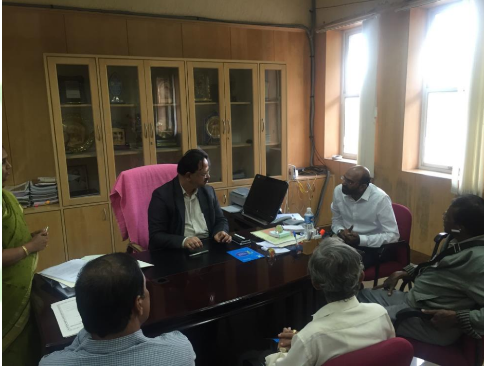
Meeting with New Director Medical Education