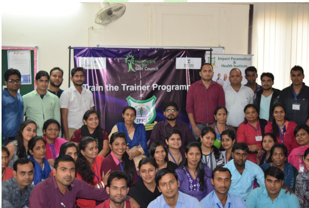
Participants at the Train the Trainer program, New Delhi

HSSC organized 'Train the Trainer' Program from 7 th to 16 th of November 2016 in New Delhi. There were in total 40 candidates for the program who were trained for the job roles of General Duty Assistant (HSS/ Q 5101) and Home Health Aide (HSS/Q 5102)