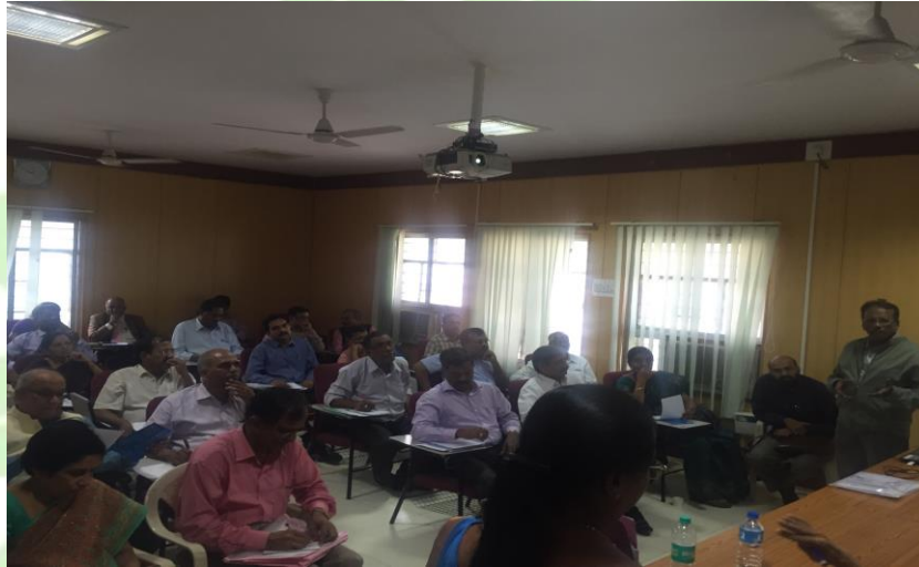
HSSC Addressing the meeting.

A meeting was scheduled with all Medical Superintendents & Principals of Government Hospitals & Colleges of Karnataka to sensitize them about the importance of registering job roles using Smart Portals. They have agreed to share the details with which HSSC will help them to get the Login credentials for the portal.