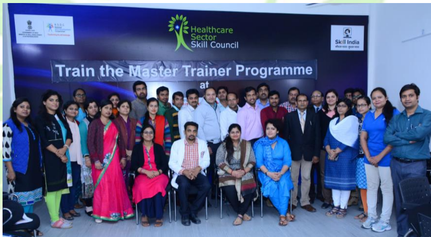
Participants along with HSSC faculties at the ToMT Program

HSSC organized the Train the Master Trainer Program from 22nd to 26th November 2016 in New Delhi for the job role of General Duty Assistant (HSS/ Q 5101), Home Health Aide (HSS/ Q 5102), Frontline Health Worker (HSS/ Q 7701), Emergency Medical Technician-Basic (HSS/ Q 2301) and Diabetes Educator (HSS/ Q 8701). There were in total 28 candidates who came from across the country to attend the training program. The program included various interactive sessions from HSSC faculties and industry expert from AIIMS and various other activities like, group discussions, role plays, and extempore. The candidates also took theory and practical sessions with the students. The participants were then assessed by HSSC accredited assessing body on domain and platform skills. The certification was done by HSSC.