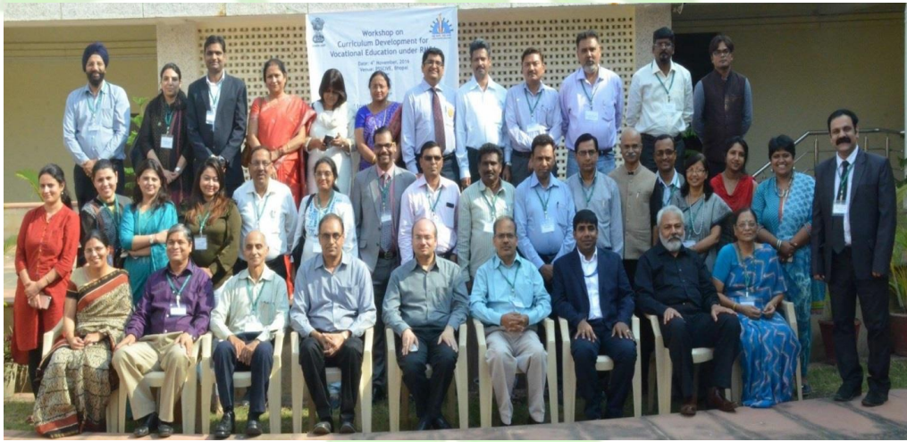
Group Photograph during workshop with MHRD, PSSICVE, NSDC and SSC was organized at Bhopal on 4.11.16