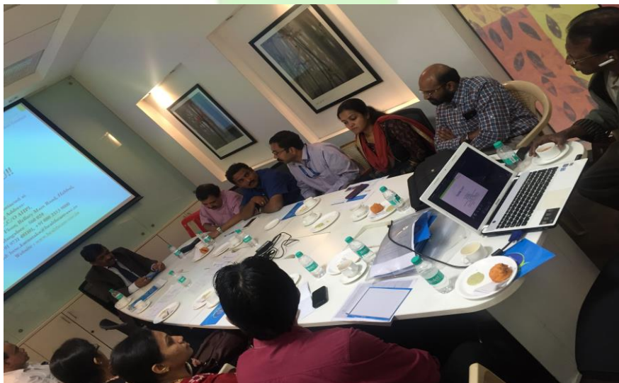
Meeting at RGUHS