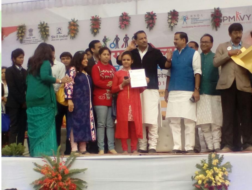
Shri Rajiv Pratap Rudy, Hon'ble Minister, MSDE, giving away offer letters to students

Ministry of Skill Development & Entrepreneurship (MSDE) in collaboration with National Skill Development Cooperation (NSDC) and Sector Skill Council's (SSC) is organizing Rozgar Mela –“A Massive Recruitment Drive” across 20 districts of U.P.in the year 2016-17. Healthcare Sector Skill Council is actively participating in this drive. Recently, HSSC along with other stakeholders organized the Rozgar Mela in the districts of Lucknow where the Hon'ble Minister Shri Rajiv Pratap Rudy, Union Minister of Ministry of Skill Development and Entrepreneurship distributed offer letters to around 3500 candidates selected by employers across the sectors. In healthcare sector, around 10 employers like Nephro Plus, Portea, Hello Health, Sahara Hospital etc. has interviewed several candidates and offered employment opportunities to around 1000 candidates.