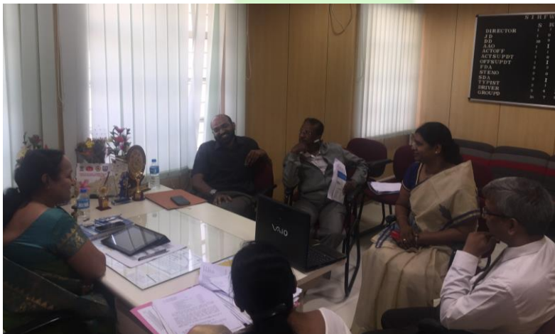
Meeting with Director, SIHF, Karnataka