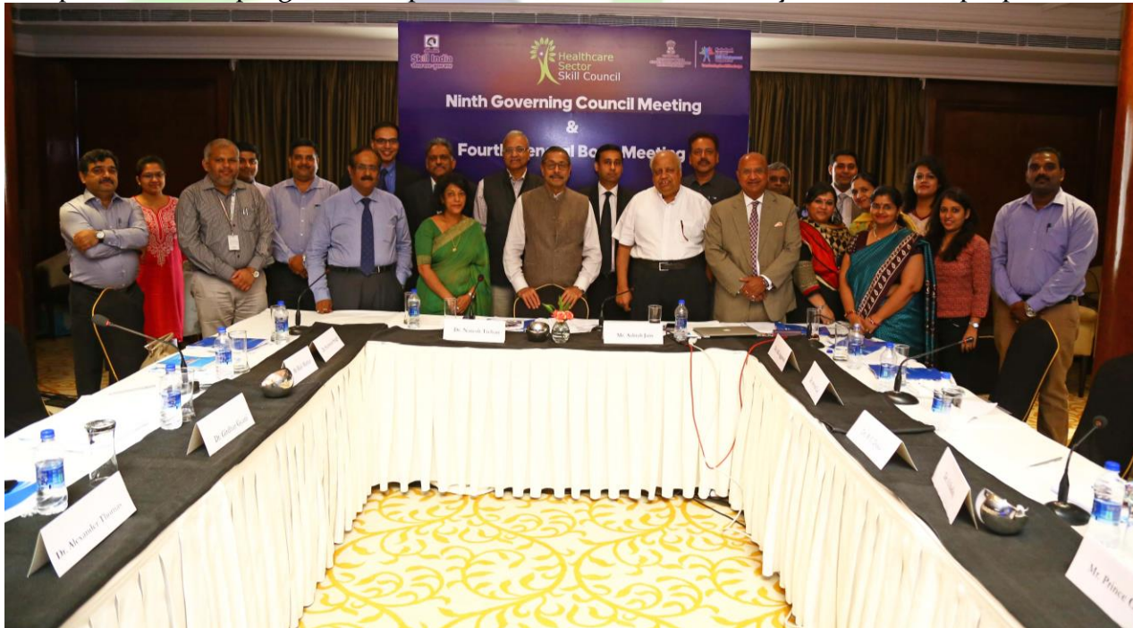
A group photograph of 4th Annual General Body Meeting