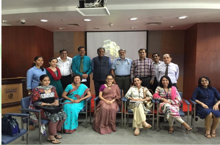
HSSC Sensitization meet